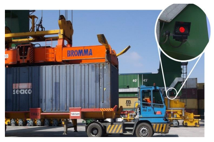
Figure 1 Prime Mover Stopped in the Correct location

Instructions are provided to the truck driver via the LED matrix. As a truck approaches, the system will detect whether the trailer is loaded. For a loaded trailer, the system will determine the profile of the load (single/twin 20', 40' or 45') and provide the