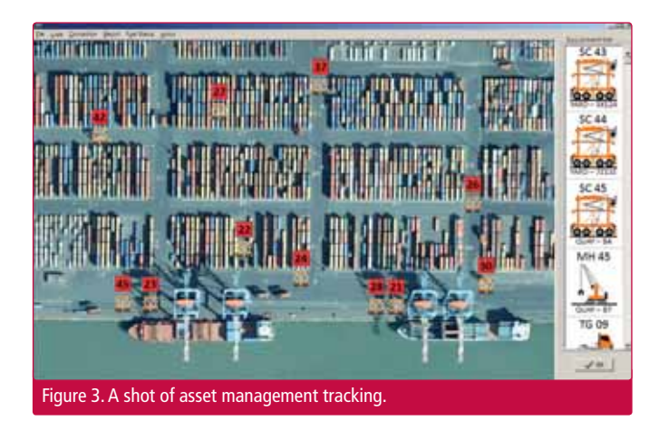
PORT TECHNOLOGY INTERNATIONAL 69

When asked what is the best radio data network for a container terminal, the answer almost certainly should be it depends on the sites' particular circumstances and requirements. WiFi networks, without doubt, offer good levels of connectivity but can be costly