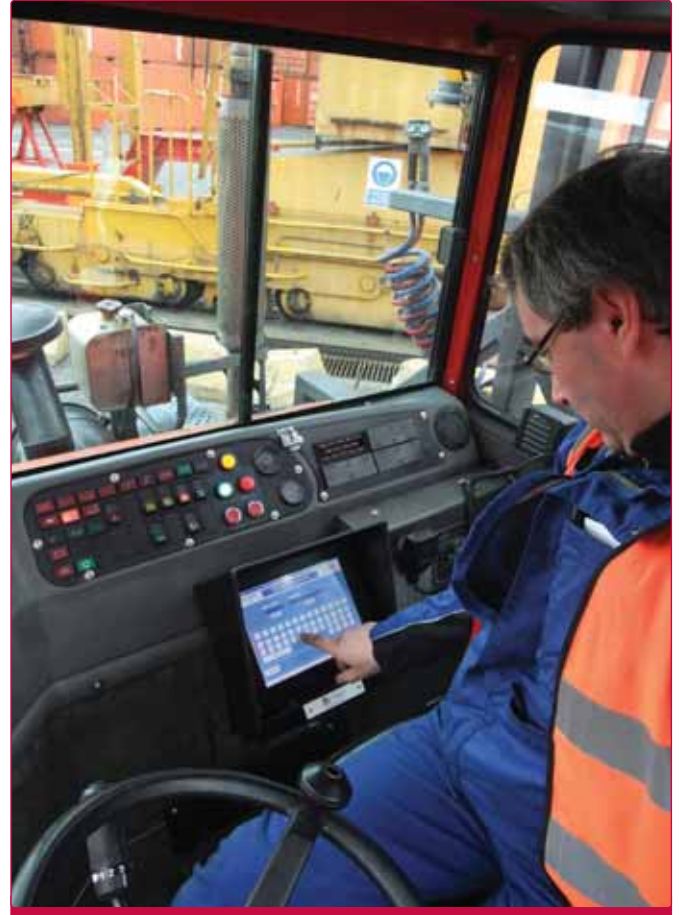
Figure 2. A picture of a RDT terminal connected to the MRS middleware.

for this medium in mind. So, at Messina, the new TOS was only able to connect to a WiFi network, which of course the terminal wasn't able to implement.