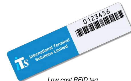
Low cost RFID tag